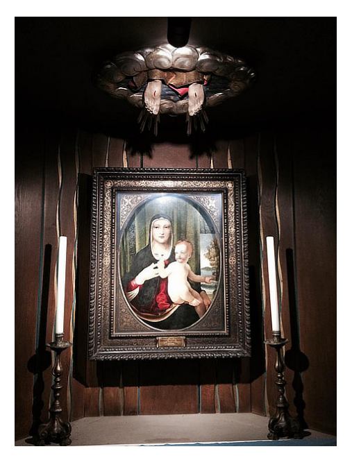
The Chapel of the Ascension - note the feet!

It's hoped that soon we can take a group from Hemel Hempstead to experience the joy of pilgrimage to Walsingham for themselves and perhaps you can be a part of that?