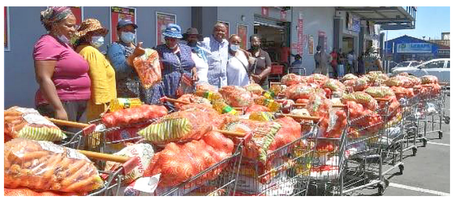
Vegetables for the children of Langa Pre-Schools