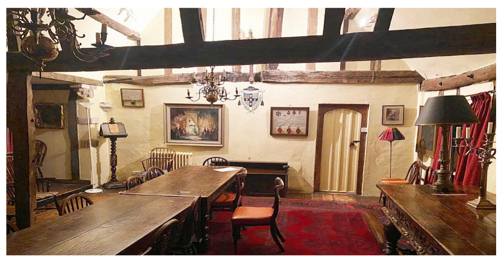
The old guardian's room in the Anglican Shrine

Before we enter the dark days when pilgrimage to Our Lady's Shrine was suppressed, it is worth seeking a flavour of those last days of pilgrimage. Who better to guide us through that than the Dutch reformer and Renaissance scholar Erasmus, who visited in 1511. By then the shrine was a shadow of its former self but his thoughts about it are amongst the few from the time that survive.