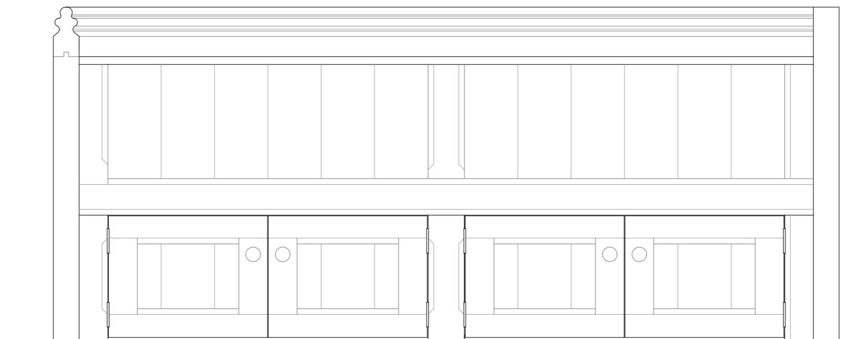
PROPOSED ELEVATION OF PEW STORAGE UNDER LECTERN