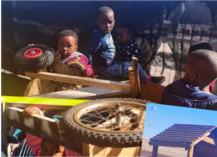
Nomonde Pre-School children having fun in their newly completed playground