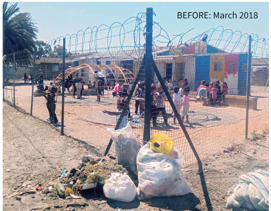
2018 - The area is known as Zone 23, Nomonde, a crowded area of shacks with homes made of materials such as corrugated iron, tarpaulin, and wood. Nomonde Pre-School before LTPT investment projects, comprised dilapidated buildings, unsuitable play equipment and poor security.

Reports on progress have been included in newsletters over the last 3 years, but the pandemic set back our programme by a few months. The project has just been completed as a selection of photos show.