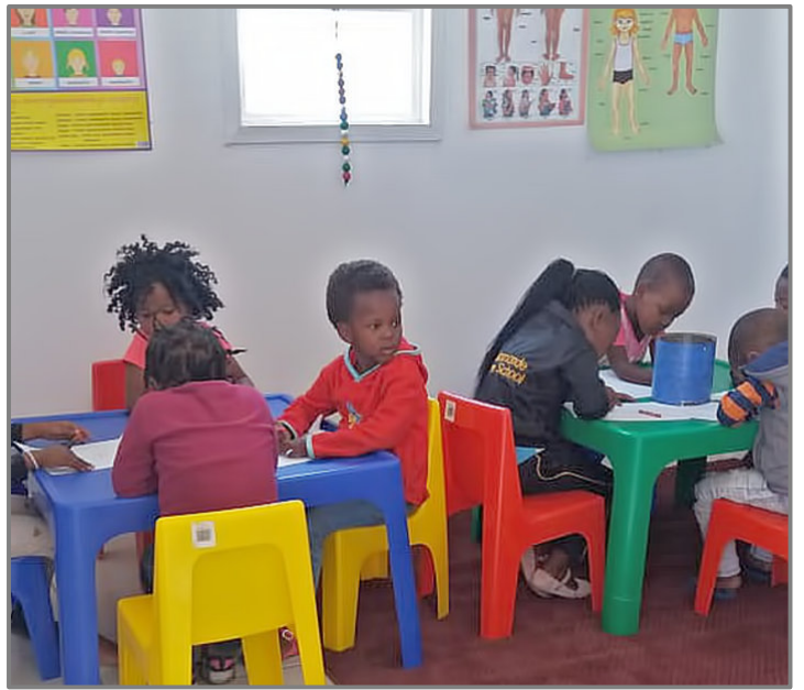
December 2018 - Two new classrooms with a canopy and a stoep constructed and equipped.