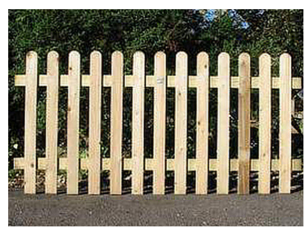
The fencing planned for the play area