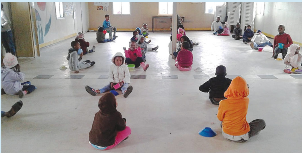
Langa children spaced out in Nomonde Pre-School awaiting lunch prepared in Bishop's kitchens and served by VUSA Academy coaches . . . .